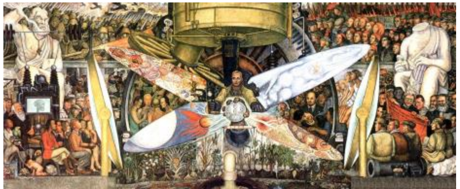
Man, Controller of the Universe by Diego Rivera

There is a great temptation to put Man at the centre of all things- or more dangerously, oneself at the centre.